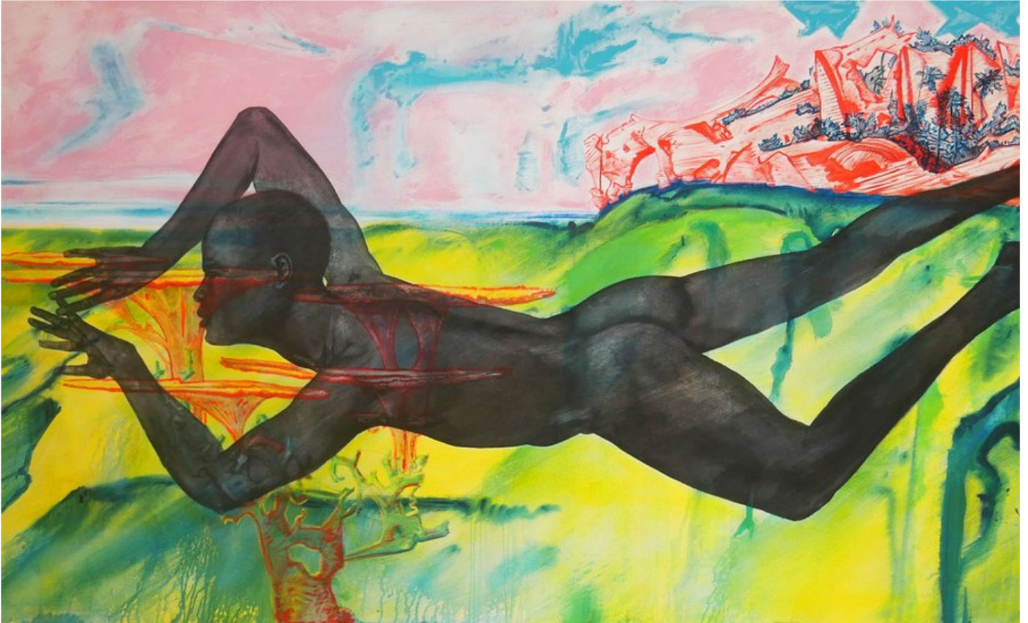
Cy Gavin, "Bather I," 2018, Image courtesy of the Artist